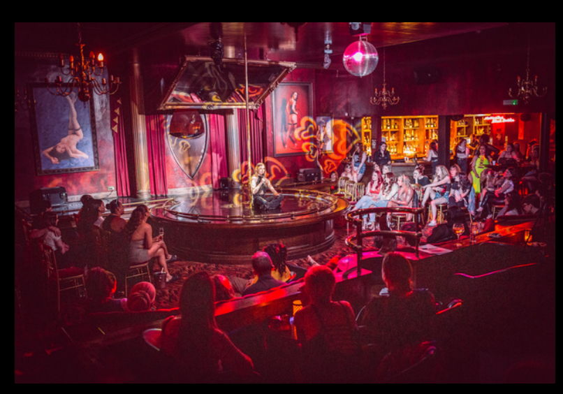
Gemma speaking at The PDSM Showcase 2023